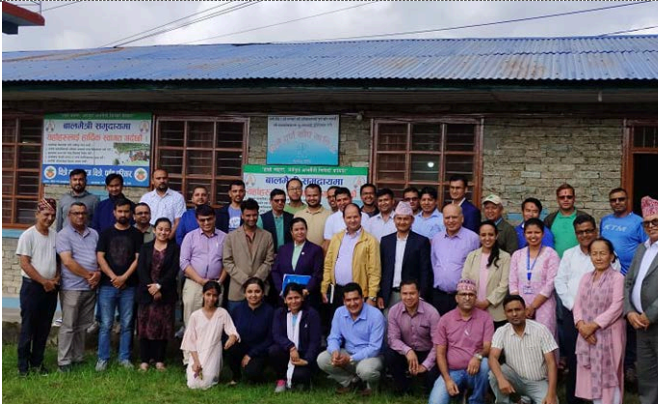
Photo Details: Group Photo after completion of Annual Program Implementation Guideline drafting workshop