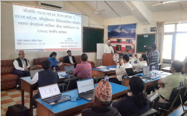
Photo Details: Workshop on revised HMIS tools and digitalization organized by Health Directorate, Pokhara