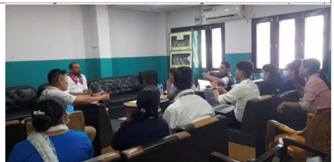
Photo Details: Discussion with Registration, Billing, Pharmacy and Laboratory departments in the presence of the Hospital Medical Superintendent for initiation of EMR in Madhyabindu Hospital, Nawalpur.