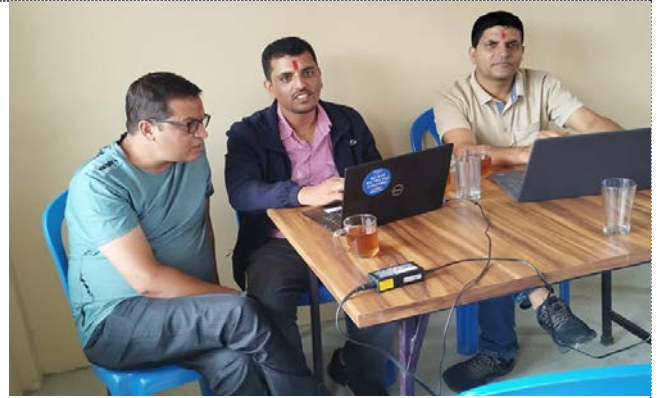
Photo Details: PHO facilitating the drafting of Annual Program Implementation Guideline drafting workshop