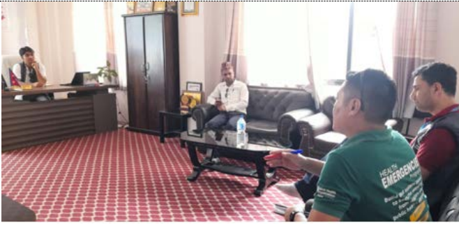
Photo Details: interaction meeting on EMR with municipality chief, Abu Khairani.