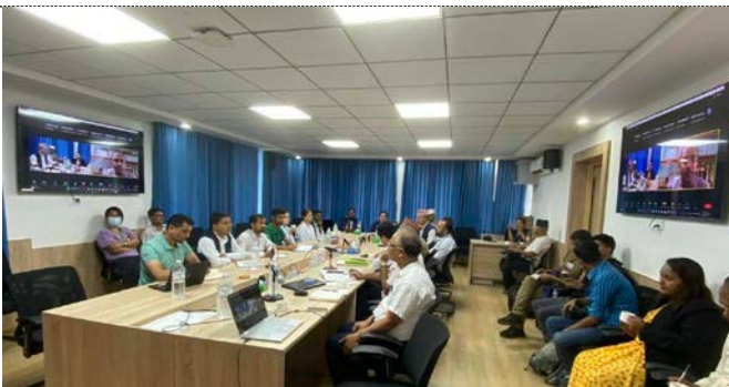
Photo Details: stakeholders meeting on Prevention, Control and Management of Conjunctivitis and Seasonal Hyperacute Pan-Uveitis (SHAPU)