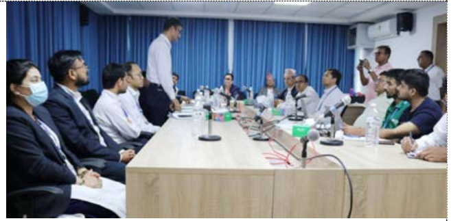
Photo Details: Inauguration program of Ambulance Dispatch Center 102 Gandaki Province